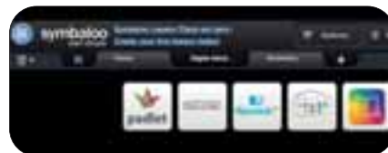
Managing popular digital storytelling creation sites

New folders can be created and named. All links relating to this topic can then be collated neatly and visually within the folder.