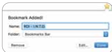
Adding a bookmark from the Chrome browser

The Internet is a rich source of teaching tips, tools and applications with potential for use in the classroom. As professionals in the classroom, teachers decide what sites/applications will be used to enhance teaching and learning. Scoilnet is our national portal at www.scoilnet.ie and is a great source of links to sites aligned with curricular objectives. We also source information to enhance teaching and learning outside of Scoilnet from a limited number of websites/blogs initially and so information management is not an issue. Sites and blogs can be bookmarked in the browser you are using for reference later.