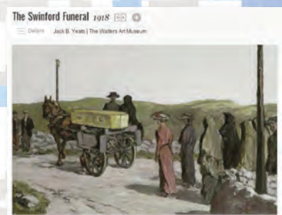
The Swinford Funeral, Jack B Yeats.

Art Project brings us into the world of visual art where users can explore art galleries and the works of numerous artists of varying genres, periods and nationalities. Some can have a surprisingly local theme as evidenced in the Jack B Yeats piece featured in the screenshot below.