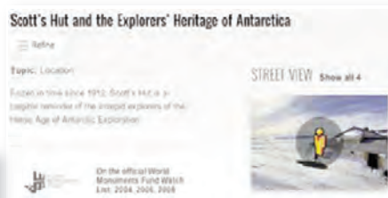
Scott's Hut, Antarctic.

The World Wonders Project brings world heritage sites online 'so that they can be explored by people around the world and preserved for future generations'.